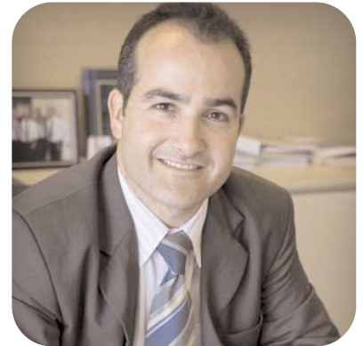
James Merlino MP Minister for Sport, Recreation and Youth Affairs

“The Country Action Grant Scheme recognises the vital role local sporting groups and associations play in strengthening communities in country Victoria.”